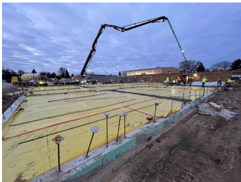
Concrete Pump HS Classrooms