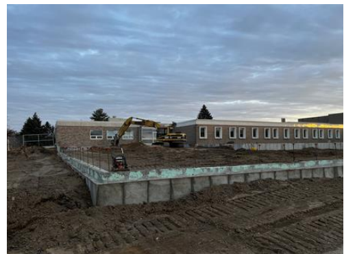
MS Classroom Foundation Walls