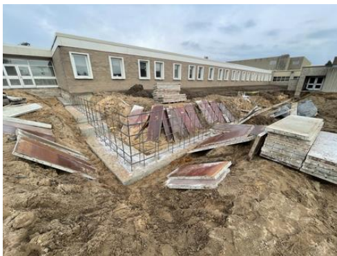
Setting Forms for MS Classrooms Walls