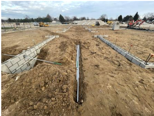
Underground Electrical in HS Classrooms