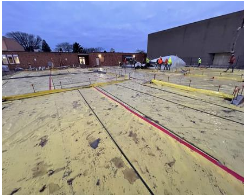
Vapor Barrier for Classroom Floor