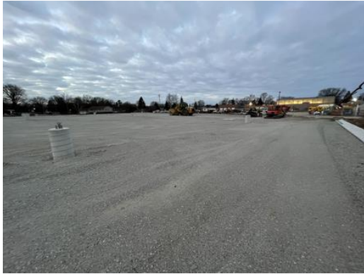
HS Student Parking Prep