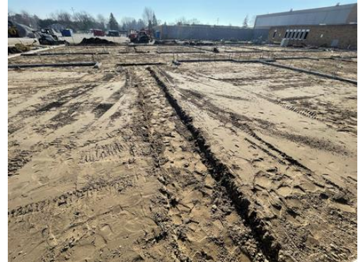
HS Thickened Slab Prep