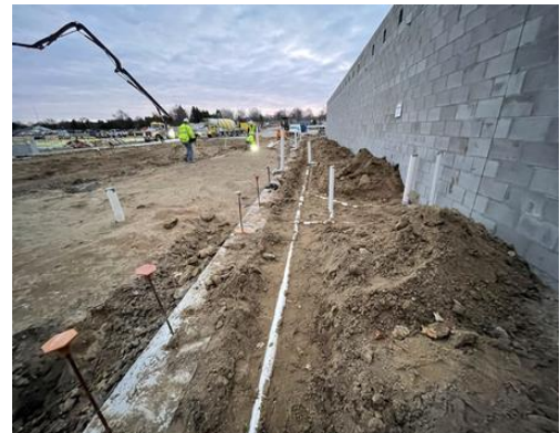
Underground Plumbing at Office Addition