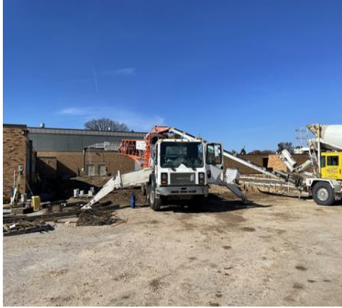
Pouring Column Pads