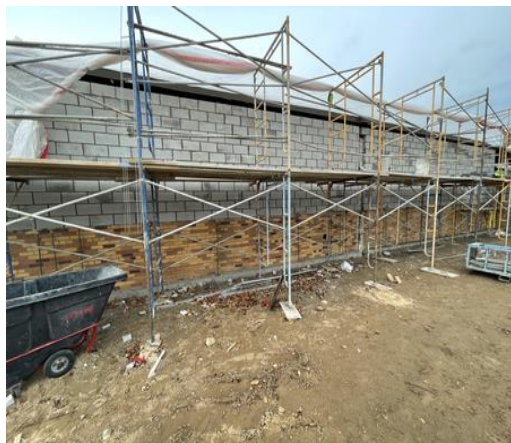
HS Office South Wall