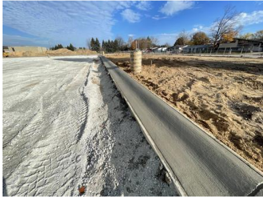
HS Student Parking Prep