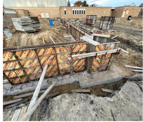
Foundation Wall at Office