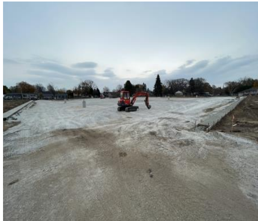
HS Student Parking Prep