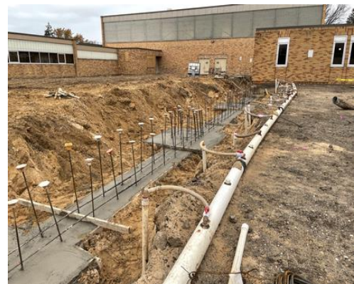
Dewatering in Place for Foundations