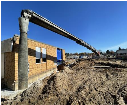
Pouring Column Pads