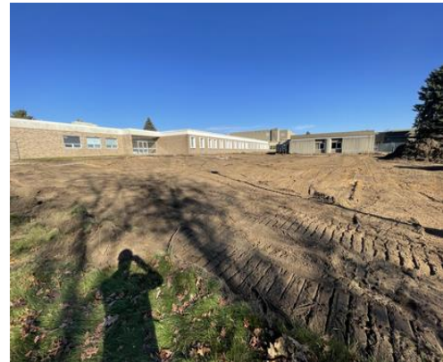
Prep Work for MS Addition