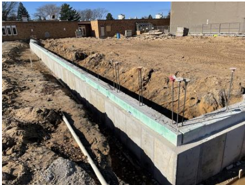
Classroom Addition Foundation Wall