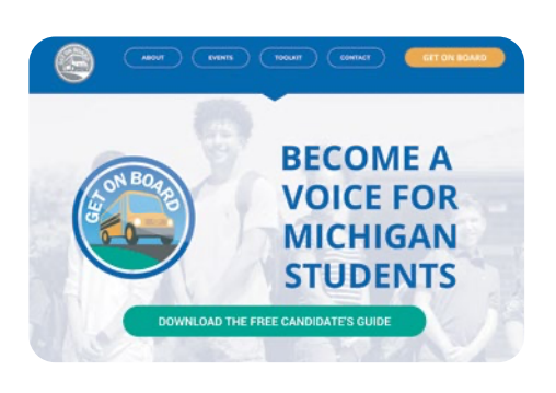
Get On Board website: getonboardmi.masb.org