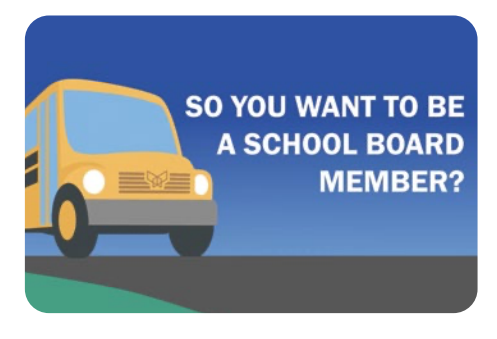
Watch this quick video with tips on How to File and #GetOnBoardMI