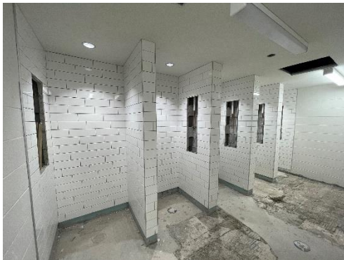
HS Locker Room Showers