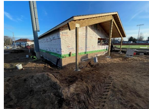
Oriole Field Team Room