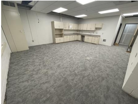
MS Staff Planning