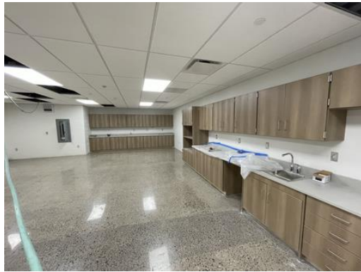
New HS Staff Planning