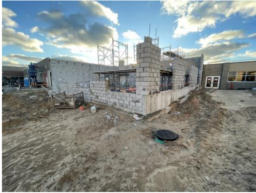
MS office Addition