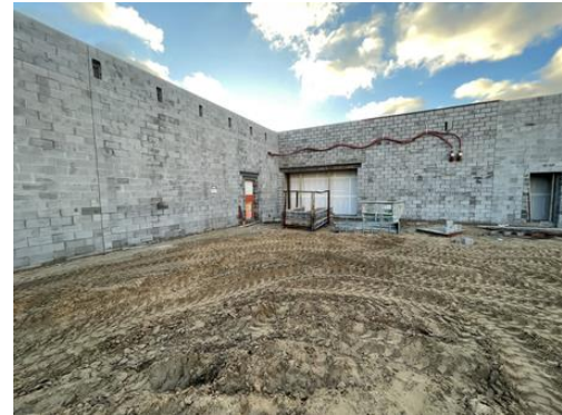
MS Office Addition