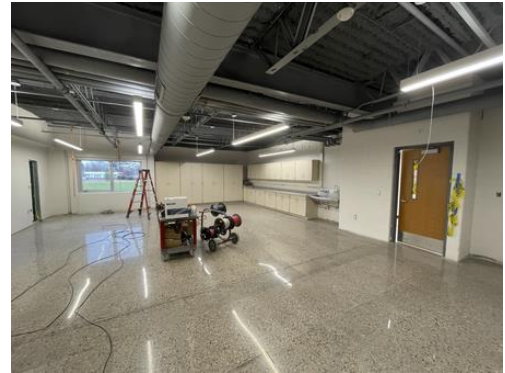
MS Art Room